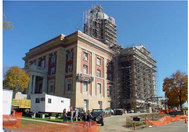
Mercer County, PA. Courthouse