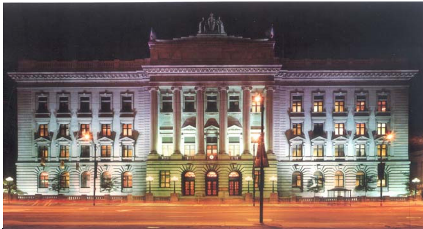
Mahoning County, OH. Courthouse